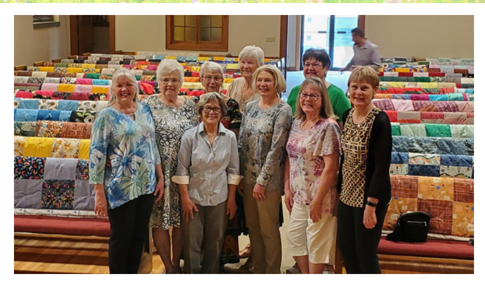
Mother's Day at Concordia