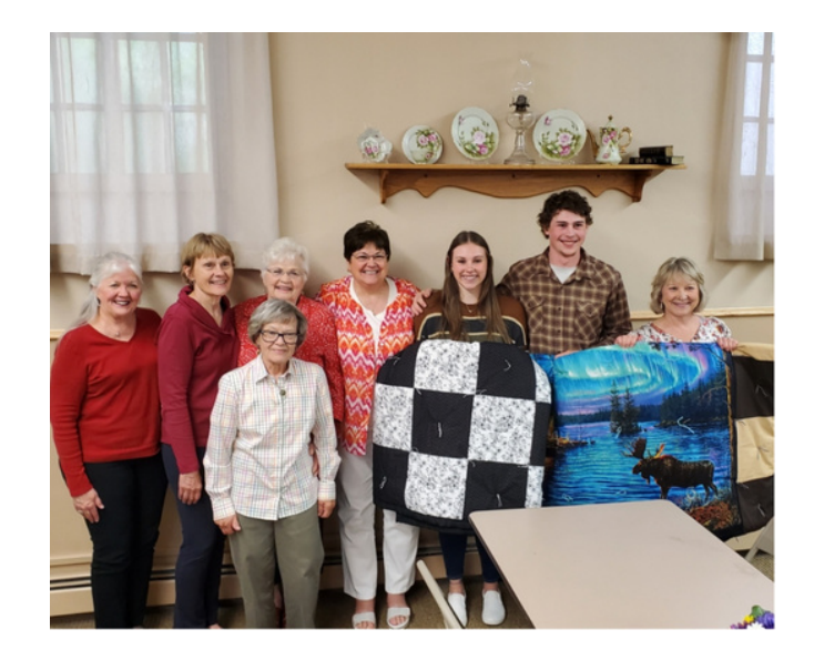
Senior Quilt Sunday-Concordia